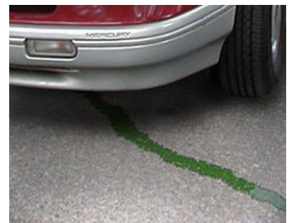
Car Leaking Fluids