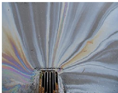
Oils and Solvents