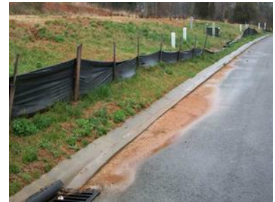
Construction Site Runoff