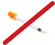
Sharps & Medical Waste