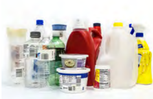
Plastic Bottles & Containers 1-5