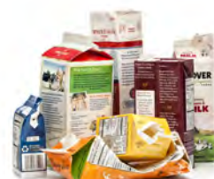
Dairy & Juice Cartons