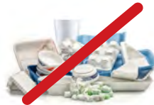
Foam Cups & Containers